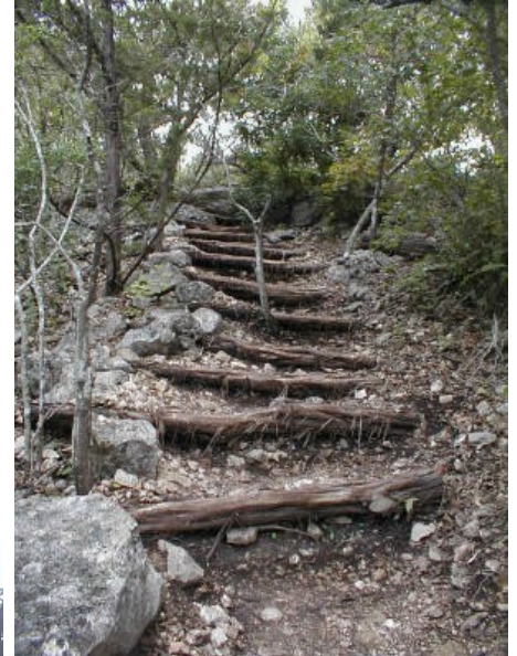
Fig.2 (example waterbars)