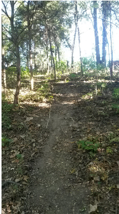
Fig.3 (current access trail)